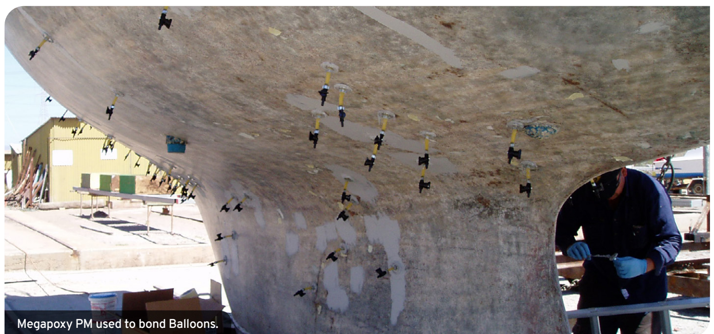
Megapoxy PM used to bond Balloons.