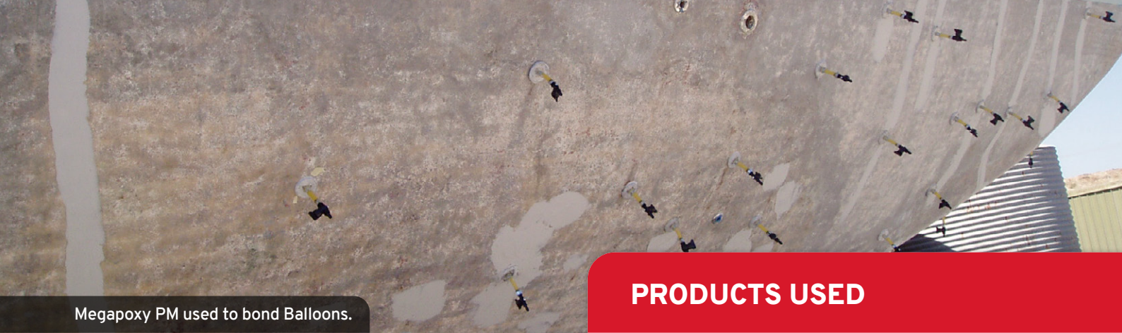
Megapoxy PM used to bond Balloons.